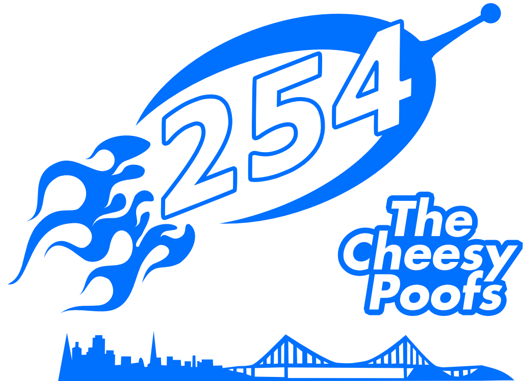
File Name: 2011 Shirt Back

The skyline is an alternate graphical element used by Team 254. The iconic San Francisco skyline is visualized in a unique graphic visualization. The skyline can be used as an accent and to provide regional context.