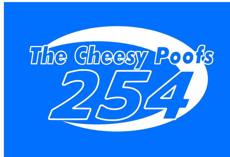
File Name: Swoosh With Nickname White