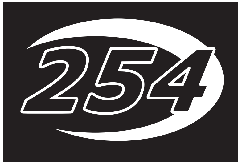
File Name: 254 Swoosh White