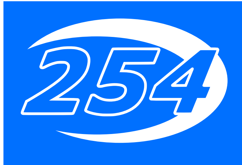
File Name: 254 Swoosh White

When displayed on a colored background, the white version of the swoosh should be used.