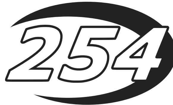
File Name: 254 Swoosh Monochrome