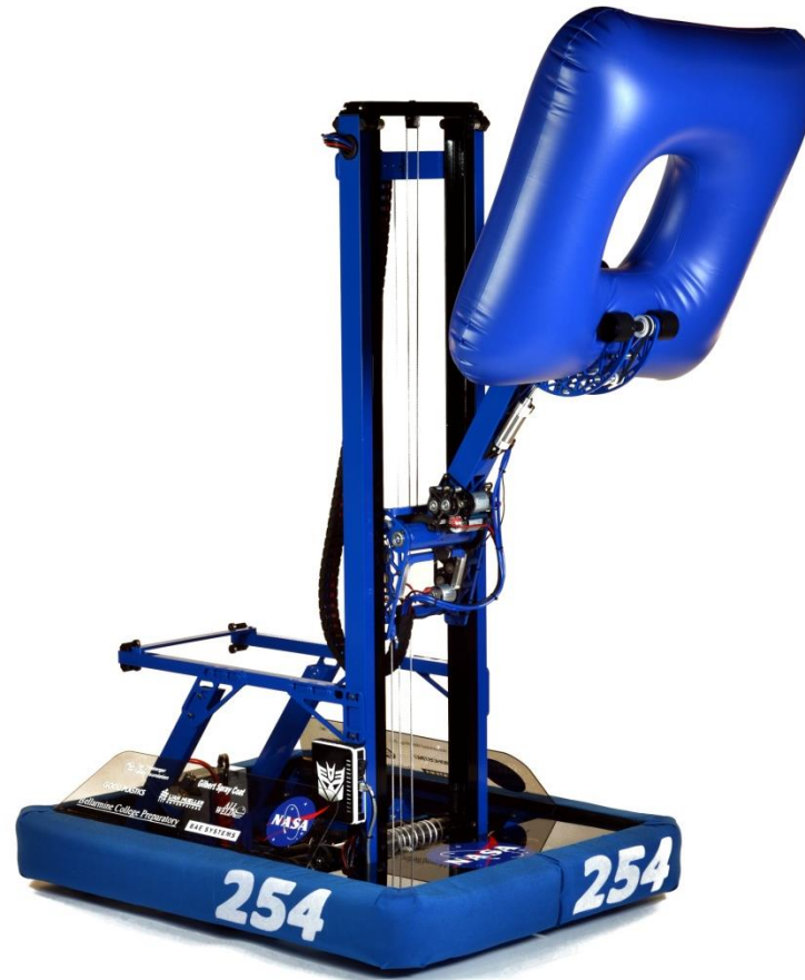
2011 FRC Robot with Sponsor Panels

On all robots, all sponsor logos should be shown in white except for the NASA meatball. On FRC robots, the logos should be displayed on grey smoked polycarbonate. On VEX robots, the logos should be displayed on blue or black panels. Logos of non-sponsors should not be shown.