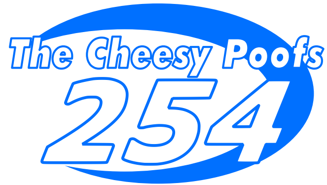
File Name: Swoosh With Nickname

To assist in team name identification, variations of the swoosh are available with the team nickname placed above the team number.