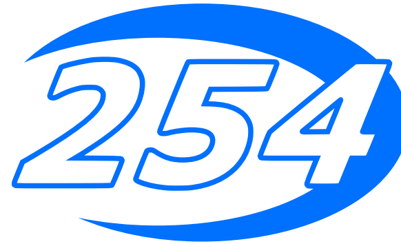
File Name: 254 Swoosh

The Team 254 swoosh should be used in compliance with the standards here. Only when necessary should a black and white version be used. The preferred background color is white. Keep the swoosh area clear of distracting elements such as type, photographs or textured backgrounds. The swoosh should always be seen clearly.