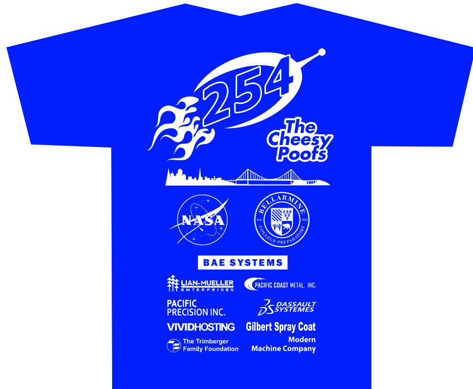
File Name: 2011 Shirt Back

Other team apparel should contain the swoosh and should not violate any of the identity standards. Otherwise, any appropriate designs are permitted for other team apparel.